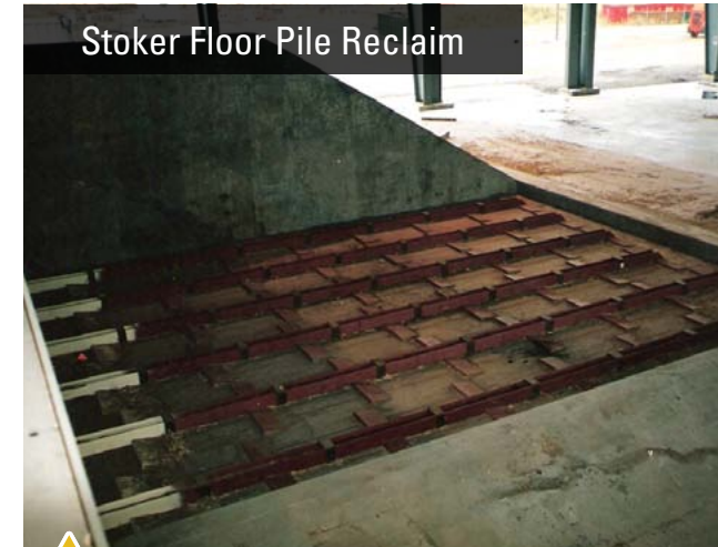
Stoker Floor Pile Reclaim

Stoker Floor Reclaims offer the many benefits pile reclaiming, with minimal maintenance. These 'Stoker Floor' or 'Ladder Floor' systems can sustain enormous piles in covered or open air environments. With the addition of a dust shroud and lump breaker, these systems allow increased uptime and flexible pile sizes. Their rugged construction allows the size of the pile to be significantly larger than the active floor area. Driving on top of the floor system, for pile reshaping, is common.