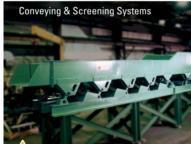
Conveying & Screening Systems

Each Reclaim and Boiler Feed System requires a combination of Conveying & Screening Systems. These can include: