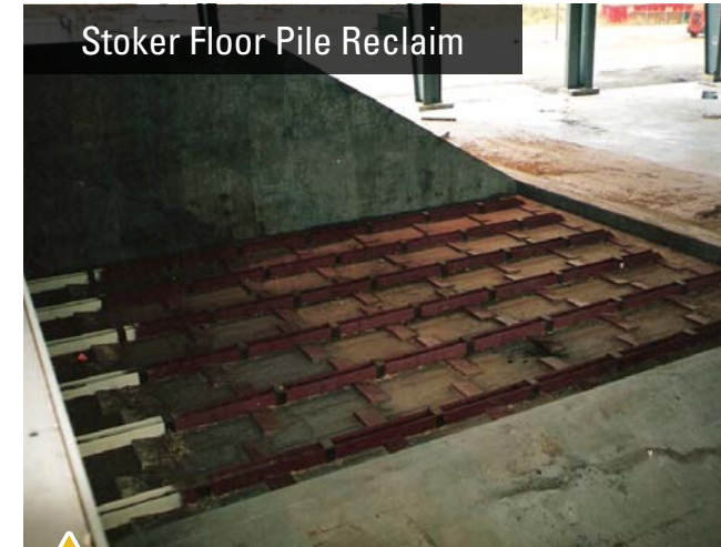
Stoker Floor Pile Reclaim

Stoker Floor Reclaims offer the many benefits pile reclaiming, with minimal maintenance. These 'Stoker Floor' or 'Ladder Floor' systems can sustain enormous piles in covered or open air environments. With the addition of a dust shroud and lump breaker, these systems allow increased uptime and flexible pile sizes. Their rugged construction allows the size of the pile to be significantly larger than the active floor area. Driving on top of the floor system, for pile reshaping, is common.