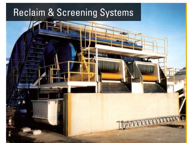
Reclaim & Screening Systems

To ensure a steady supply of material, each Boiler System requires a metering bin to handle feed system surges. These bins are custom designed to meet the specifications of your project, and easily handle the high temperature environments within the boiler room.